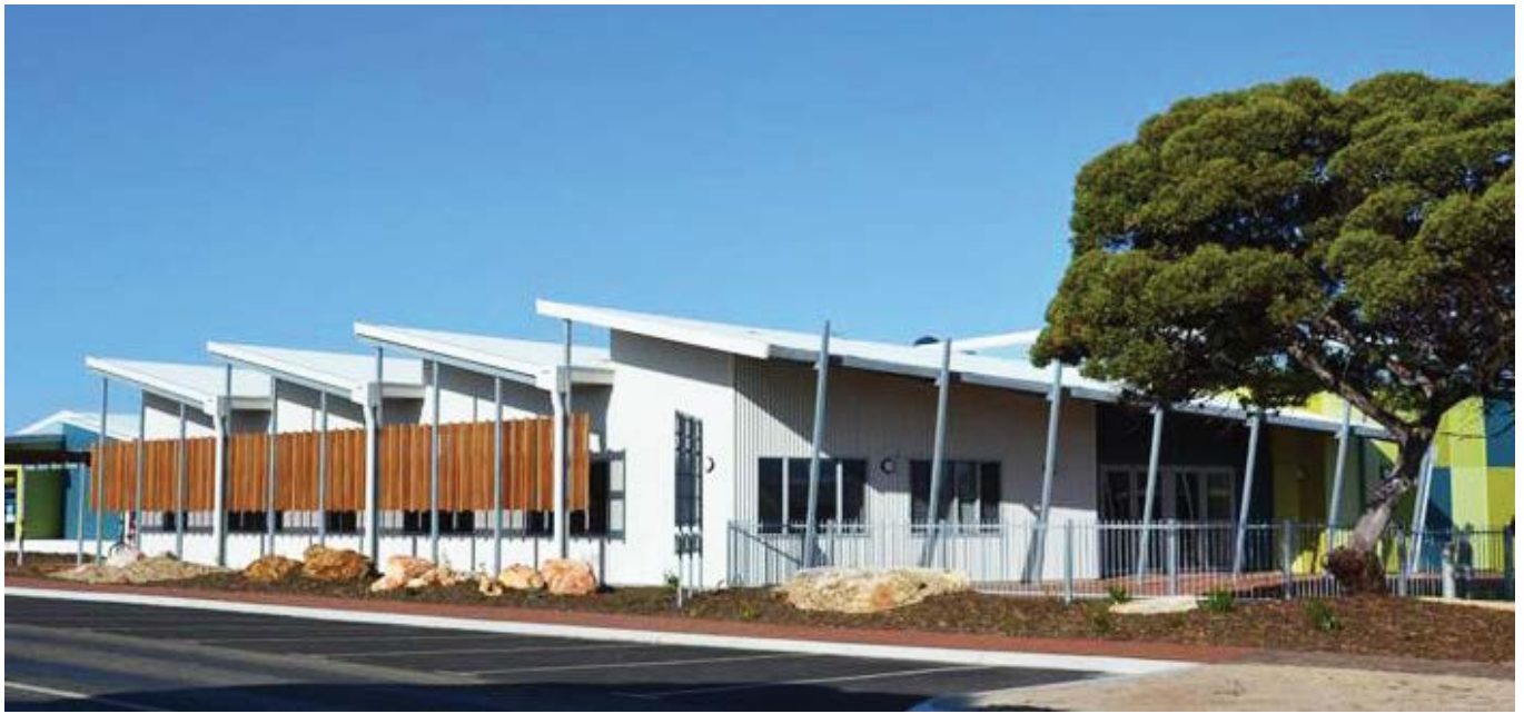
Hopetoun Community Centre's new town hall