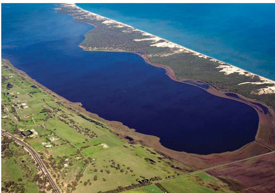
Leschenault estuary, photo courtesy of Leschenault Catchment Council and Jeff Henderson

Second-round grant applications close on 30 June 2016. For information on eligibility, or to apply, visit www.dca.wa.gov.au