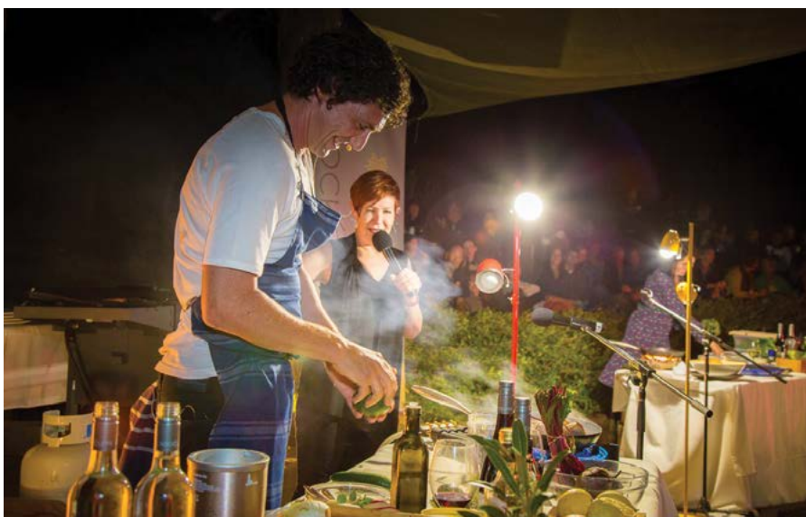
Celebrity Chef Colin Fassnidge cooks up a storm at the Rockcliffe Night Market

Held on Thursday 24 March, the picnic saw participants embark on a scenic helicopter flight to Breaksea Island where they tasted some of the region's finest beer, wine, and canapes, prepared with a focus on native Australian ingredients.