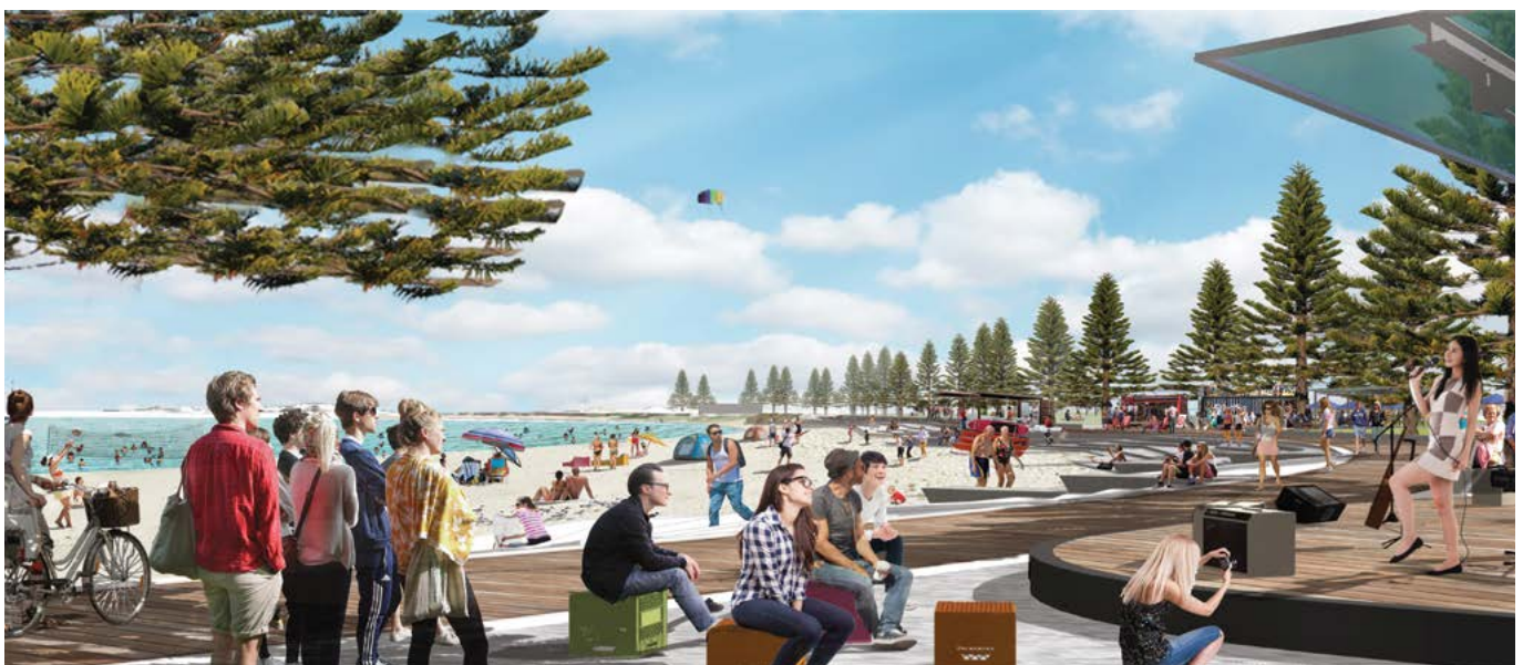
Artist impression of Koombana Bay

Royalties for Regions, through the Growing Our South initiative, will invest $600 million to revitalise the South West, Peel, Wheatbelt and Great Southern regions. For more information, visit www.swdc.wa.gov.au