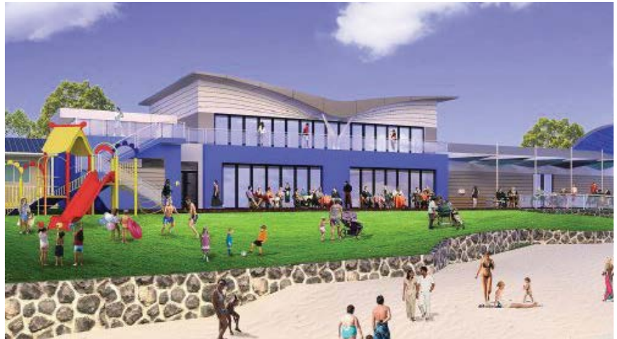
Dolphin Discovery Centre rear elevation impression by MCG Architects, image courtesy of SWDC

Bunbury's Dolphin Discovery Centre will also be redeveloped to provide new space for conference and meeting facilities, café restaurants, merchandising, and contemporary