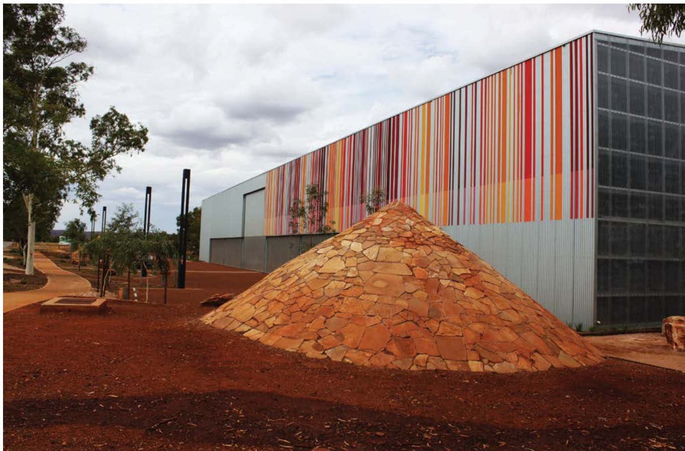
Facade of the EPAC on Newman Drive