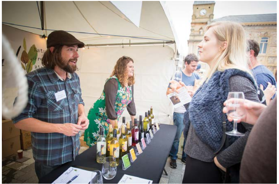
Talking food and wine at the Albany Seafood Night Markets

For more information on funding for regional events, visit www.tourism.wa.gov.au