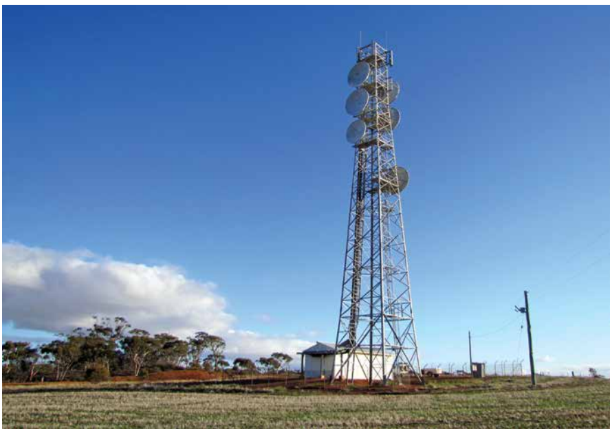
Tammin mobile tower

"This in turn enhances safety and convenience for people living in and visiting regional Western Australia and ultimately breaks down the digital divide between regional and urban areas," Ms Mackenzie said.