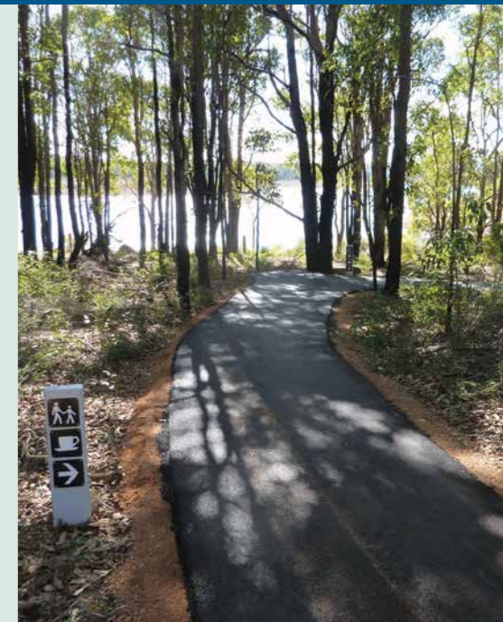
Mountain bike pump track in Logue Brook, photo courtesy of Department of Parks and Wildlife

Logue Brook recorded more than 47,000 visits in 2014-15 and is located about 10 minutes away from the town of Harvey.