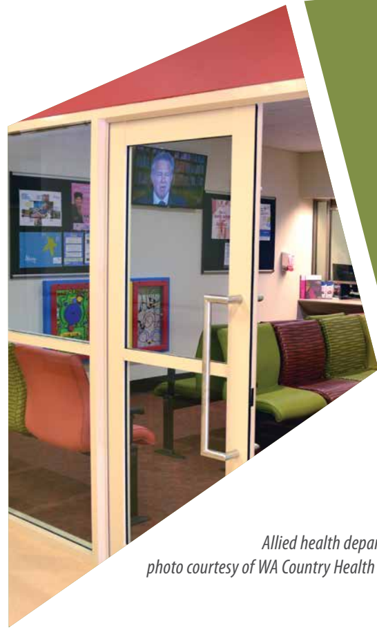
Allied health department, photo courtesy of WA Country Health Service