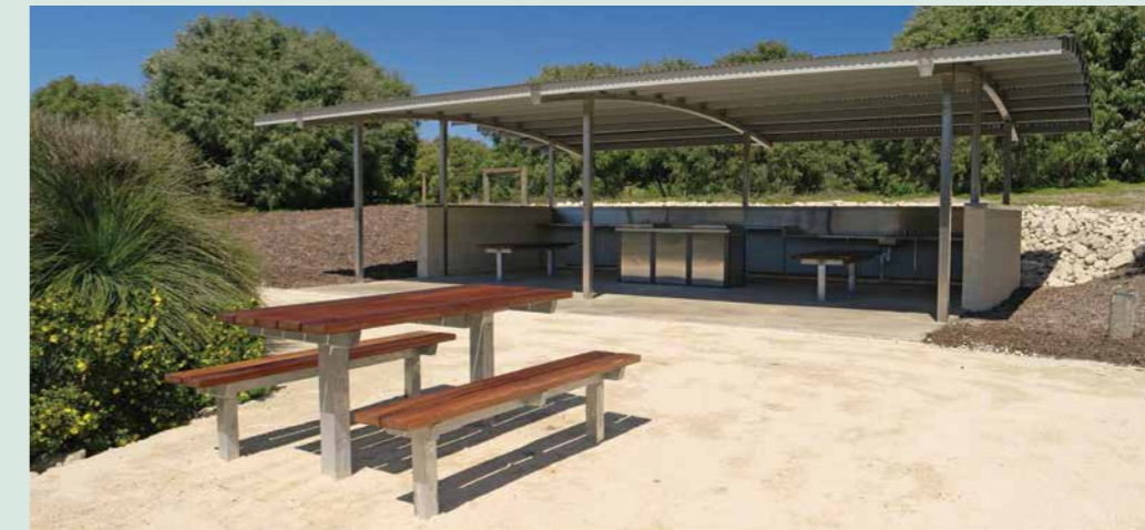
Barbecue shelter in Conto