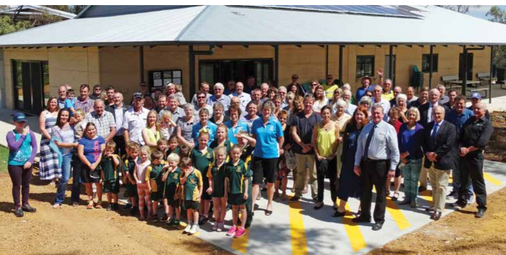
Community gather at the official opening of Yuna Multipurpose Centre